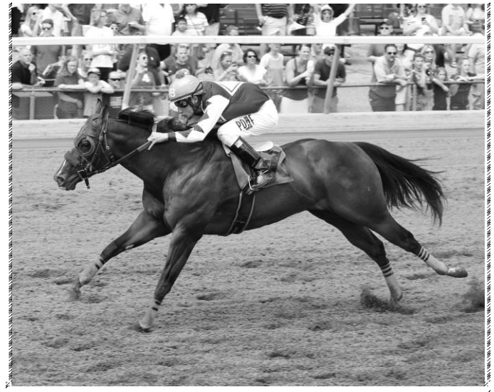
Horse of the Year: Amy's Challenge