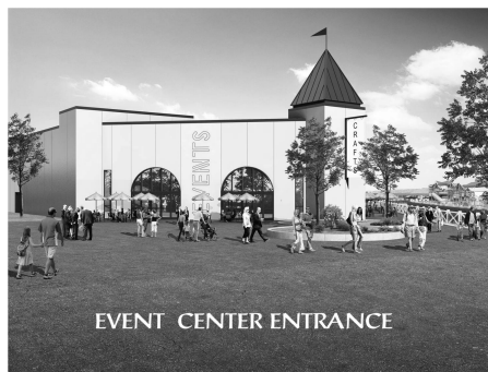
EVENT CENTER ENTRANCE

Canterbury Park had an official ground breaking ceremony on May 21, 2014 for their new event and expo center coming in the fall of 2014. The new facility will add 24,000 square feet of new exhibition space for a total of 80,000 square feet of exhibition space. It will be used for trade shows, vendor shows, fairs, festivals as well as for other functions. When complete, this facility will be the fourth largest convention space in Minnesota.